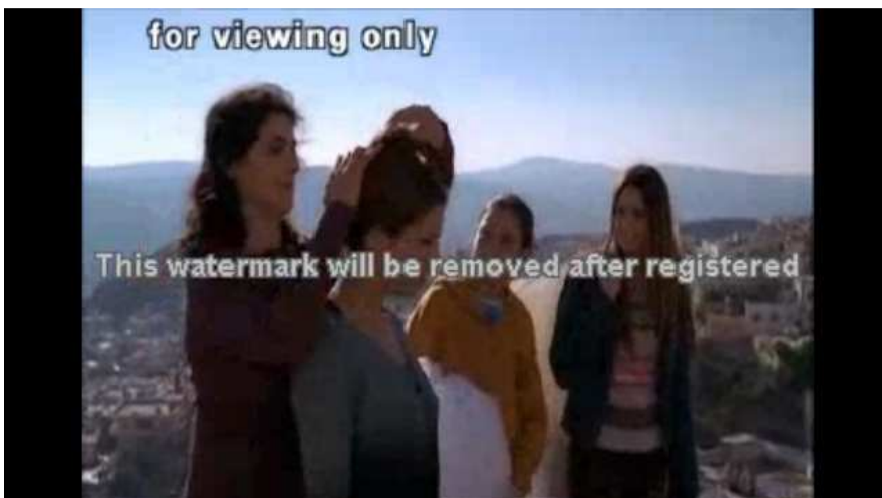
Figure 2: The Landscape

The Syrian Bride is set in the arid and semi-arid area of the border between Syria and Israel. The pictures in the film bring out the real life landscape of the territory. There are mountains in the background, which is the real life scenery in Golan. The film is also characterized by higher than average illumination. This is also appropriate since the border between Israel and Syria is open, plant life is scarce, and the sun shines brightly.